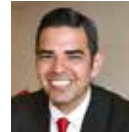
Mayor Robert Garcia

I hope you are as excited as I am about the many changes and improvements across Long Beach. We are all looking forward to the dedication of our new Civic Center this summer.