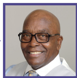
Did not respond by deadline